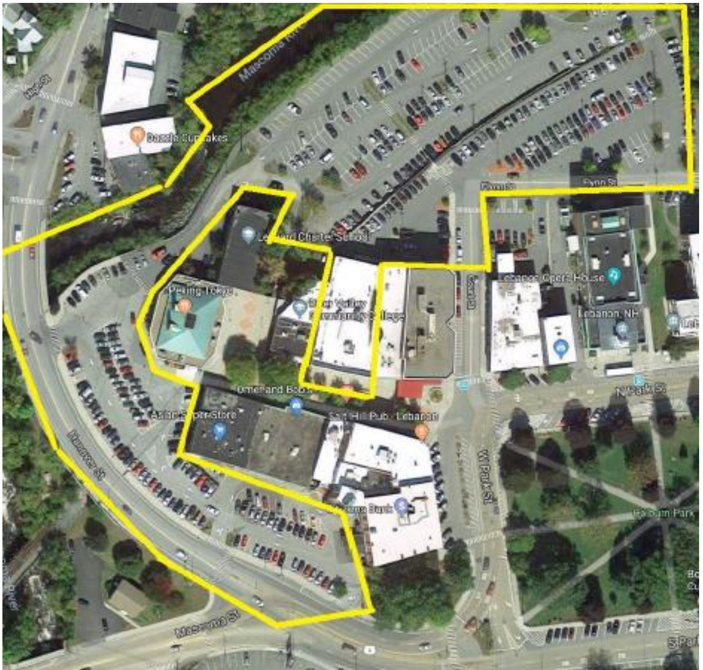
Lebanon Academic Center – 15 Hanover Street, Lebanon, NH 03766